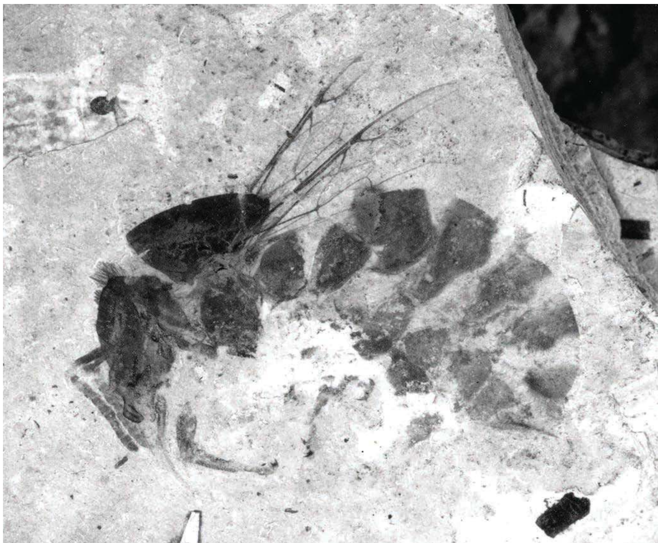
Fig. 1. Photograph of a 30-million-year-old fossil of a worker honey bee in the species Apis henshawi . This worker is 0.55 inches long, so its size is close to that of workers in Apis mellifera .

Difference 8: Colonies live with vs. without a stable nest organization. Disruptions of nest organization for beekeeping may hinder colony functioning. In nature, honey bee colonies organize their nests with a pre-